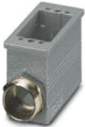
Coupling housing, made of metal, powder-coated type 2, number of modules 3, cable screw connection Pg21

Please be informed that the data shown in this PDF Document is generated from our Online Catalog. Please find the complete data in the user's documentation. Our General Terms of Use for Downloads are valid ( http://phoenixcontact.com/download )