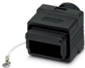
Protective covers, Degree of protection: IP65, Material: PA-GF

Please be informed that the data shown in this PDF Document is generated from our Online Catalog. Please find the complete data in the user's documentation. Our General Terms of Use for Downloads are valid ( http://phoenixcontact.com/download )