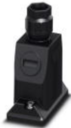
HEAVYCON ADVANCE B10 sleeve housing, with screw locking (Allen screw), plastic, height: 100 mm, with 1 x M25 thread, straight cable outlet

Please be informed that the data shown in this PDF Document is generated from our Online Catalog. Please find the complete data in the user's documentation. Our General Terms of Use for Downloads are valid ( http://phoenixcontact.com/download )