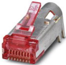
RJ45 male insert, CAT6, 8-pos., shielded, IDC pierce connection, for AWG 27 litz wires ... 24, with strain relief

Please be informed that the data shown in this PDF Document is generated from our Online Catalog. Please find the complete data in the user's documentation. Our General Terms of Use for Downloads are valid ( http://phoenixcontact.com/download )