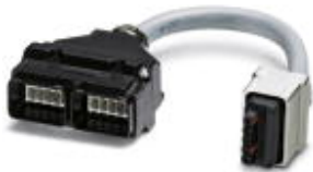
Y distributor with MSTB plug

PROFINET Y distributor with assembled power line, 5-pos., IP65/IP67, MSTB plug with metal housing on 2x socket in metal housing, cable length: 0.2 m