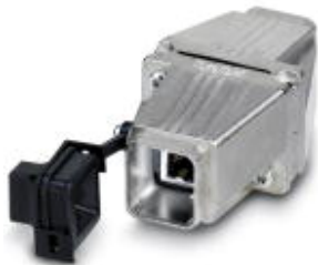
RJ45 push-pull coupling, IP67, metal, CAT5e, with protective cover, color: Nickel-plated

Please be informed that the data shown in this PDF Document is generated from our Online Catalog. Please find the complete data in the user's documentation. Our General Terms of Use for Downloads are valid ( http://phoenixcontact.com/download )