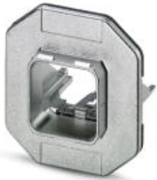
RJ45 panel mounting frame, IP67, for push-pull interlocking, metal, with Freenet system, for round mounting cutout, with seal

Please be informed that the data shown in this PDF Document is generated from our Online Catalog. Please find the complete data in the user's documentation. Our General Terms of Use for Downloads are valid ( http://phoenixcontact.com/download )