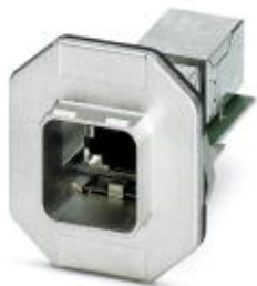
RJ45 panel mounting frame, IP67, for push-pull interlocking, metal, with the Freenet system, for round panel cutout, with the RJ45 socket/socket socket insert, with seal, without mounting screws

Please be informed that the data shown in this PDF Document is generated from our Online Catalog. Please find the complete data in the user's documentation. Our General Terms of Use for Downloads are valid ( http://phoenixcontact.com/download )