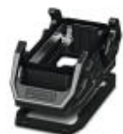
HEAVYCON EVO panel mounting base, plastic, B16, with double locking latch, height: 30.5 mm, with flat gasket

Housing - HC-EVO-B16-BWD-PLRBK - 1407648