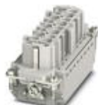
HEAVYCON socket insert, B16 series, 16 + PE-pos., push-in connection

Contact insert - HC-B 16-I-PT-F - 1407731