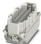
HEAVYCON pin insert, B16 series, 16 + PE-pos., push-in connection

Contact insert - HC-B 16-I-PT-M - 1407732