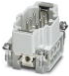
HEAVYCON male insert, B6 series, 6-pos., screw connection

Contact insert - HC-B 6-I-UT-M - 1648115