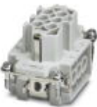
HEAVYCON female insert, B6 series, 6-pos., screw connection

Contact insert - HC-B 6-I-UT-F - 1648128