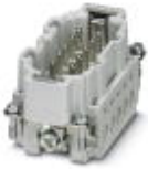
HEAVYCON male insert, B10 series, 10-pos., screw connection

Contact insert - HC-B 10-I-UT-M - 1648173