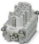
HEAVYCON female insert, B10 series, 10-pos., screw connection

Contact insert - HC-B 10-I-UT-F - 1648186