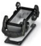
HEAVYCON B16 panel mounting base, with double locking latch, height: 29 mm, with flat gasket

Contact insert - HC-B 16-I-UT-F - 1648241