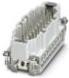
HEAVYCON male insert, B16 series, 16-pos., screw connection

Contact insert - HC-B 16-I-UT-M - 1648238