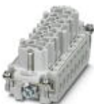
HEAVYCON female insert, B16 series, 16-pos., screw connection

Contact insert - HC-B 16-I-UT-F - 1648241