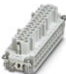
HEAVYCON female insert, B24 series, 24-pos., screw connection

Contact insert - HC-B 24-I-UT-F - 1648306