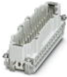
HEAVYCON pin insert, B24 series, 24-pos., screw connection

Contact insert - HC-B 24-I-UT-M - 1648296