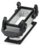
HEAVYCON B24 panel mounting base, with double locking latch, height: 29 mm, with flat gasket

Contact insert - HC-B 24-I-UT-F - 1648306