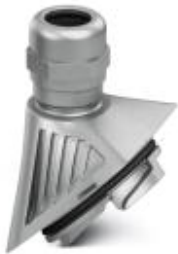
EVO EMC cable gland with bayonet locking, B series, size M20, cable diameter: 9 ... 13 mm

Please be informed that the data shown in this PDF Document is generated from our Online Catalog. Please find the complete data in the user's documentation. Our General Terms of Use for Downloads are valid ( http://phoenixcontact.com/download )