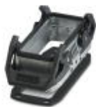
HEAVYCON B16 panel mounting base, with double locking latch, with flat gasket, salt-water-resistant aluminum, conductive profile gasket

Housing - HC-STA-B16-BWD-ELC-AL - 1411327