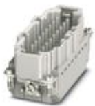
HEAVYCON pin insert, B16 series, 16 + PE-pos., push-in connection

Contact insert - HC-B 16-I-PT-M - 1407732