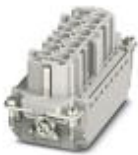
HEAVYCON socket insert, B16 series, 16 + PE-pos., push-in connection

Contact insert - HC-B 16-I-PT-F - 1407731