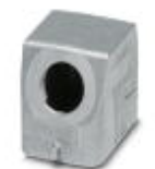
Sleeve housing B6, for single locking latch, Material: Die-cast aluminum, salt water resistant, Cable outlets: 1, lateral, Height: 52 mm, Cable gland: none, Gland: no, 1x M20, Standard