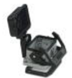
HEAVYCON B6 panel mounting base, with single locking latch, with plastic protective cover, with flat gasket, salt-water-resistant aluminum, conductive profile gasket.