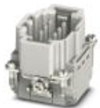
HEAVYCON pin insert, B6 series, 6 + PE-pos., push-in connection