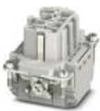
HEAVYCON socket insert, B6 series, 6 + PE-pos., push-in connection