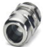
Cable gland, Cable gland material: Nickel-plated brass, External cable diameter 6 mm ... 12 mm, Shielding: No, Connecting thread: M20, Color: silver