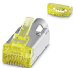
Male insert RJ45, CAT6A, 10 Gigabit

Please be informed that the data shown in this PDF Document is generated from our Online Catalog. Please find the complete data in the user's documentation. Our General Terms of Use for Downloads are valid ( http://phoenixcontact.com/download )