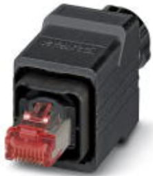
RJ45 connector, IP67, with push/pull interlocking (version 14), plastic housing, for 1 Gigabit, for 24 ... 25 AWG stranded conductors

Please be informed that the data shown in this PDF Document is generated from our Online Catalog. Please find the complete data in the user's documentation. Our General Terms of Use for Downloads are valid ( http://phoenixcontact.com/download )