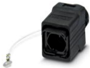
Protective cover, IP67, to cover the contact insert in the RJ45 and SC-RJ push-pull panel mounting frames

Please be informed that the data shown in this PDF Document is generated from our Online Catalog. Please find the complete data in the user's documentation. Our General Terms of Use for Downloads are valid ( http://phoenixcontact.com/download )