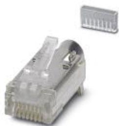
RJ45 pin insert, CAT5, 8-pos., shielded, IDC connection technology, for 27 ... 26 AWG litz wires, with strain relief

Please be informed that the data shown in this PDF Document is generated from our Online Catalog. Please find the complete data in the user's documentation. Our General Terms of Use for Downloads are valid ( http://phoenixcontact.com/download )