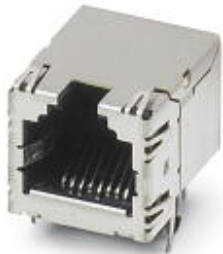
RJ45 socket insert, for PCB assembly, CAT6, 8-pos., shielded, with angled solder pins, 1x

Please be informed that the data shown in this PDF Document is generated from our Online Catalog. Please find the complete data in the user's documentation. Our General Terms of Use for Downloads are valid ( http://phoenixcontact.com/download )