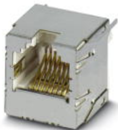
RJ45 socket insert, for PCB assembly, CAT6, 8-pos., shielded, with straight solder pins, 1x

Please be informed that the data shown in this PDF Document is generated from our Online Catalog. Please find the complete data in the user's documentation. Our General Terms of Use for Downloads are valid ( http://phoenixcontact.com/download )