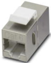
RJ45 socket insert, modular (Keystone), CAT6 (Link test), 8-position, shielded, socket on socket

Please be informed that the data shown in this PDF Document is generated from our Online Catalog. Please find the complete data in the user's documentation. Our General Terms of Use for Downloads are valid ( http://phoenixcontact.com/download )