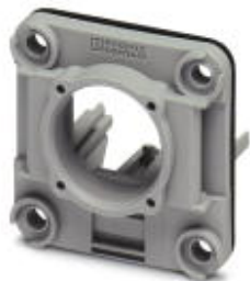
Panel mounting frame, IP67, for Freenet system, for round panel cutout, with grommet, without mounting screws, color: gray

Please be informed that the data shown in this PDF Document is generated from our Online Catalog. Please find the complete data in the user's documentation. Our General Terms of Use for Downloads are valid ( http://phoenixcontact.com/download )