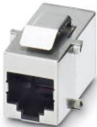
RJ45 socket insert, modular (Keystone), CAT3, 8-pos., shielded, socket on socket

Please be informed that the data shown in this PDF Document is generated from our Online Catalog. Please find the complete data in the user's documentation. Our General Terms of Use for Downloads are valid ( http://phoenixcontact.com/download )