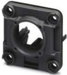
Panel mounting frame, IP67, for Freenet system, for round panel cutout, with grommet, without mounting screws, color: black

Please be informed that the data shown in this PDF Document is generated from our Online Catalog. Please find the complete data in the user's documentation. Our General Terms of Use for Downloads are valid ( http://phoenixcontact.com/download )