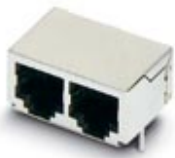
RJ45 socket insert, 2x, for PCB assembly, CAT5e, 8-pos., shielded, with angled solder pins

Please be informed that the data shown in this PDF Document is generated from our Online Catalog. Please find the complete data in the user's documentation. Our General Terms of Use for Downloads are valid ( http://phoenixcontact.com/download )