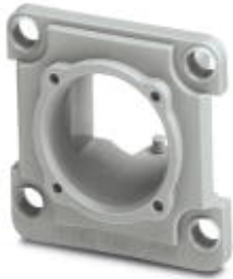
RJ45 panel mounting frame, IP67, for PCB connection, for square panel cutout, with grommet, without mounting screws, color: gray

Please be informed that the data shown in this PDF Document is generated from our Online Catalog. Please find the complete data in the user's documentation. Our General Terms of Use for Downloads are valid ( http://phoenixcontact.com/download )