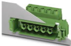
The figure shows a 5-pos. version of the product

Plug component, Nominal current: 76 A, Rated voltage (III/2): 1000 V, Number of positions: 3, Pitch: 10.16 mm, Connection method: Screw connection with tension sleeve, Color: green, Contact surface: Tin