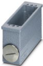
Panel mounting base, made of metal, powder-coated type 4, number of modules 5, cable screw connection Pg21

Please be informed that the data shown in this PDF Document is generated from our Online Catalog. Please find the complete data in the user's documentation. Our General Terms of Use for Downloads are valid ( http://phoenixcontact.com/download )